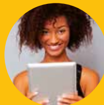
PERSONAL PROJECTS (FOR SINGLE YOUNG PEOPLE)