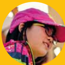
FIRST DECISIONS (8-11)